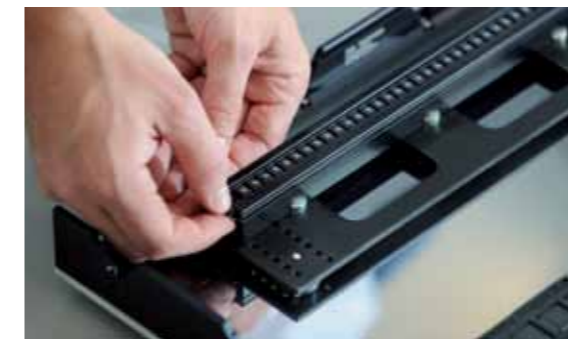
Handle short tape clips with the Tape Clip Magazine.

Minimize production costs by using the Tape Clip Magazine to handle short tape clips. With its width adjustment capability, different combinations of tape sizes can be fitted alongside each other in the magazine. The Tape Clip Magazine is available in two sizes, with a maximum capacity of 5 and 11 pieces of 8 mm tape, respectively.