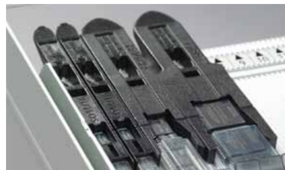
A wide range of snap-in stick positioners available.

The optional large-reel attachment extends your feeding capability up to 24" tape reels, for tape widths ranging from 8 mm to 152 mm. Available for Agilis and Agilis Flex.