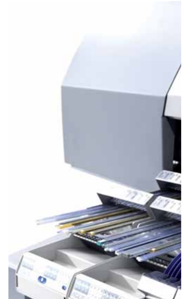
Agilis Stick Magazine effectively handles any component on stick.

The Agilis Stick Magazine, ASM, utilizes a high-precision, short-stroke linear drive with a servo-controlled, horizontal motion to effectively reduce operator assistance and component waste. Because the ASM handles a very wide range of SMT components – from the smallest TSSOP to large PLCCs and high connectors – you will always be prepared for any job. Removable stick pallets with a built-in pallet ID and barcode system allow you to replenish and pre-load pallets, as well as prepare data before pallets are loaded into the magazine. Feeding is automatically calculated based on component data entered prior to loading. Pick-up positions are automatically localized and trimmed as well, thus eliminating the setup and changeover time associated with other stick feeders. With ASM, you can simply plug in and go.