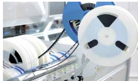
LRA for even the largest tape reels.

Increase your flexibility and efficiency by keeping pre-loaded feeders on hand, in additional Agilis bins. The bins are available in two versions: 7" reels and 13" reels (each holds 8 reels).