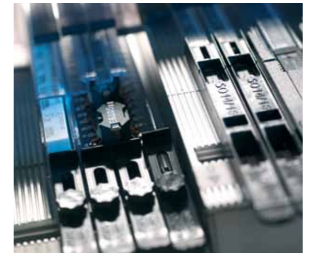
Agilis stick pallet with a capacity for 16 pcs of 10 mm sticks.