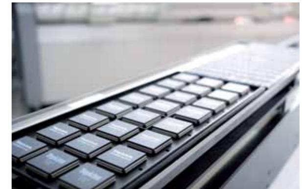
Tray Wagon Magazine has a capacity of up to 7 JEDEC trays.

The Tray Wagon Magazine (TWM) provides matrix tray capability for use when limited quantities of trays are required. The magazine is fitted within the machine's ordinary magazine slot in the same manner as with tape and stick magazines. The matrix trays are placed on a servo-controlled tray table that positions the components on the tray in the pick-up position. The tray table is interchangeable with the other available sizes – from the smaller single 'module' (occupies one magazine slot in the machine) up to the largest (occupies three magazine slots).