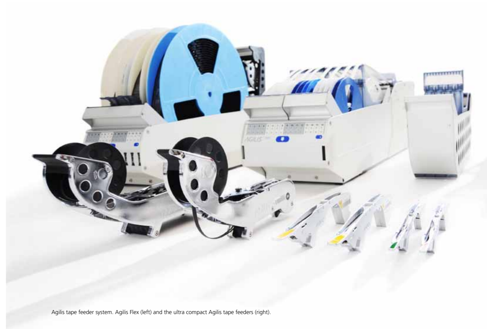
Agilis tape feeder system. Agilis Flex (left) and the ultra compact Agilis tape feeders (right).

The Agilis feeder system is designed to handle practically all tape and stick components. The simplicity of its design means you can now load and unload feeders in a flash and save countless hours of operator time.