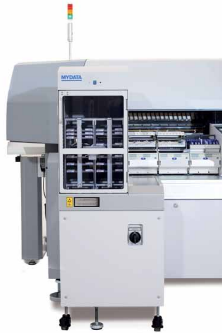
The dual-track Tray Exchanger, with a 32 JEDEC tray capacity, changes trays in hidden time.

With its 32 JEDEC matrix tray capacity, dual-track design and series of intelligent functions, the Tray Exchanger (TEX) is the ideal solution for matrix tray management. The dual-track design allows the MYDATA placement machine to pick from one track while the other is being changed. An empty-tray warning function and a built-in barcode system enable tray recognition. This eliminates additional programming when trays are replenished. To protect delicate components, tray accelerations are also controllable. If your production needs change, you can easily remove the TEX and retrofit it into any position in the machine. And, since the TEX uses only two magazine positions, it is possible to have several TEXs on one machine. To utilize the dual-track functionality, the TEX can be equipped with two cassettes with narrow tray pallets. However, for handling of larger trays, it is also available with a wide pallet cassette.