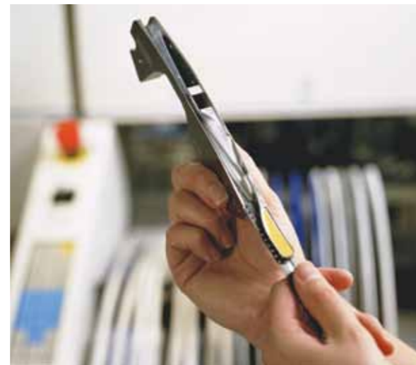
The compact Agilis tape feeder is extremely fast to load