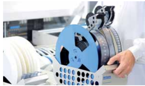
Agilis Bins for efficient off-line preparation.

Even with the industry's most agile feeder systems, there are times when standard solutions won't suffice. Should you have special feeder requirements, we can help build a solution to fit your application. From magazine and stick positioner alterations to a specially designed range of accessories, we do everything we can to help you get more out of your feeders and equipment.