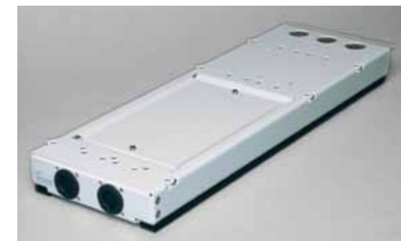
The Generic Feeder Interface available for special applications.

The Generic Feeder Interface (GFI) is just one example of MYDATA's customized solutions. The GFI enables you to connect and run various special applications as well as third-party feeders from the magazine slot in a MYDATA machine. More information about this possibility is available upon request.