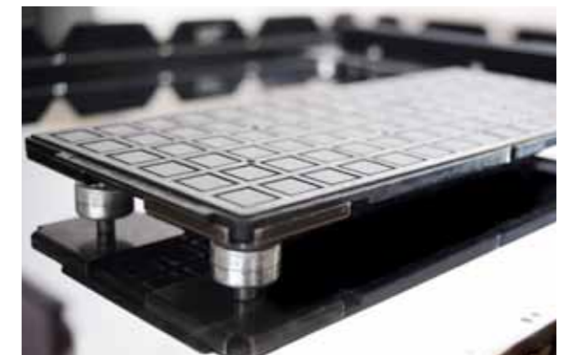
Flexible Tray Holder is an effective unit for small tray volumes.

The Flexible Tray Holder is an effective unit for handling single-matrix trays. Four magnetic corner holders and four under-tray supports can affix trays of any size. There are no adjustments to be made and no tools required. Simply position a tray with the holders, teach the machine software its location and start mounting.